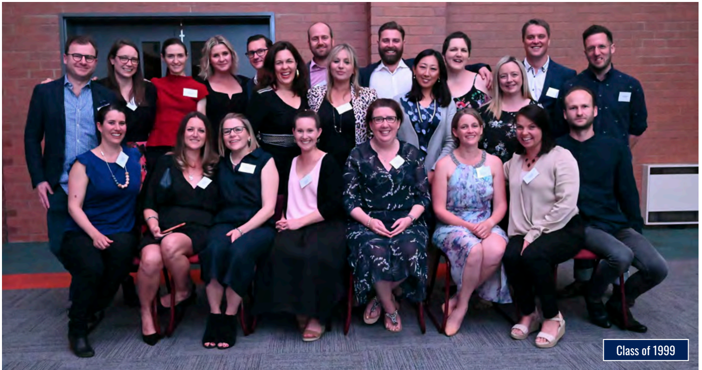
Class of 1999