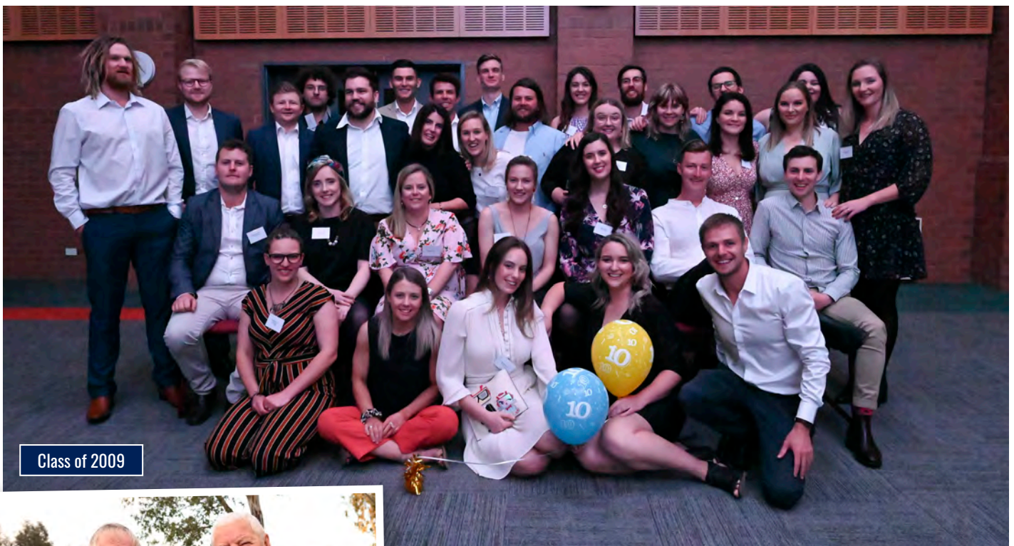
Class of 2009