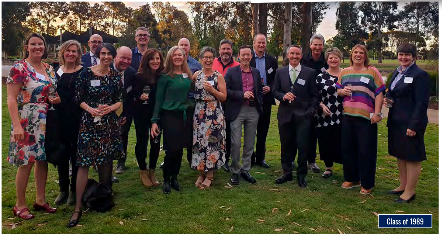
Class of 1989