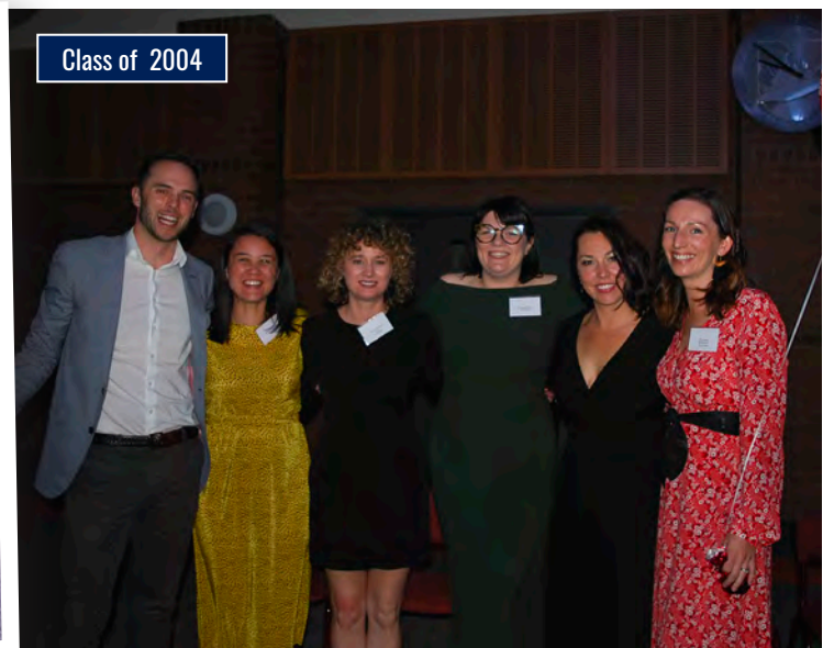
Class of 2004