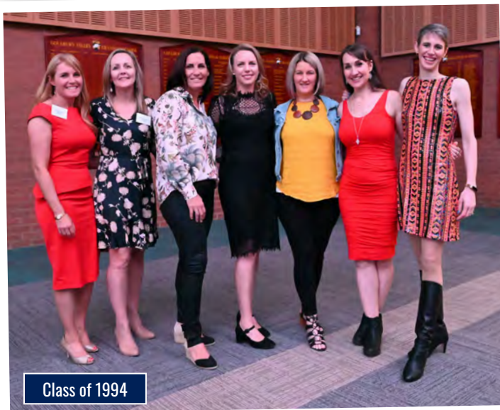
Class of 1994